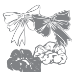
Ribbons/Scrunchies Black or White