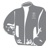
College Sports Spray Jacket