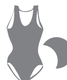
College Swimsuit/Cap Worn for interschool swimming