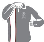
College Rugby Top