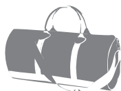
College Sports Bag