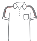
College Polo Top